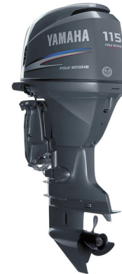
F115TXR / LF115TXR