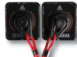
➤ Lanyard Switch Panels for Quad (Main or 2nd Station)