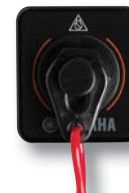
➤ Lanyard Switch Panel for Single/Twin/Triple