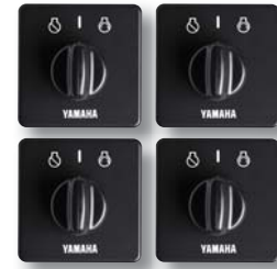
➤ Main Key Switch Panels for Quad