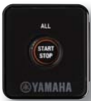
➤ "All Start" Panel for Twin and Triple