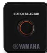
➤ Station Selector Panel for Single/Twin/Triple/Quad

The 'plug-and-play' nature of Command Link Plus allows for easy addition of a second station and the components needed to run them. From station selector panels to lanyards, this new technology means maximum convenience in a minimum of space.