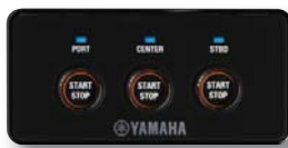
➤ Start/Stop Panel for Triple (Main or 2nd Station)

The appropriate start/stop panel is used in conjunction with the correct key panel for the application, and they feature lights which indicate when outboards are running. They greatly simplify the starting and stopping process of the outboards. There's even an "All Engine" start/stop button, which allows multiple engines to be started successively (to prevent high amperage draw on the starting battery) or stopped simultaneously with the touch of a single button. For convenience and protection, engines can not be started while running.