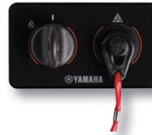
➤ Main Key Panel for Twin and Triple