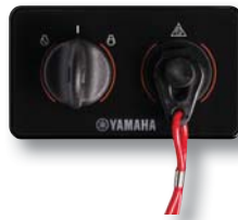
➤ Main Key Switch Panel for Single