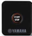
➤ Start/Stop Panel for Single (2nd Station)