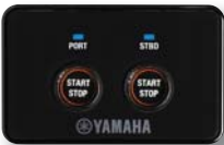
➤ Start/Stop Panel for Twin (Main or 2nd Station)